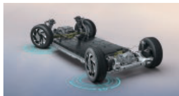
The world's only MPV with active rear-wheel steering as standard*