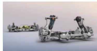
The only intelligent dual-chamber air suspension in China*