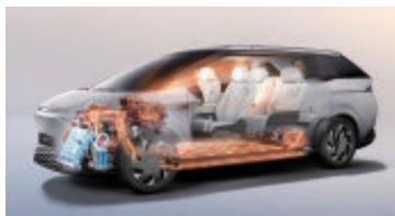
800V XPower electric drive system