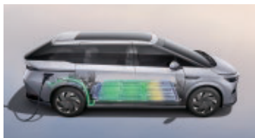
Full-range 800V high-voltage SiC silicon carbide platform

Intelligent power control, say goodbye to anxiety and welcome flexible and comfortable driving